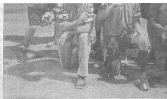
Rural Net batted their way to the top of the men's league.