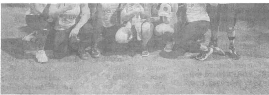
Pitch Slap beat out the Red Solo Cups for the title.